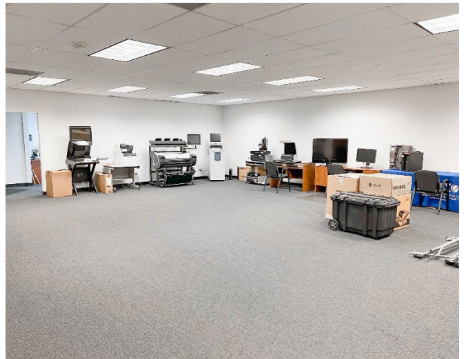
Open Office Space